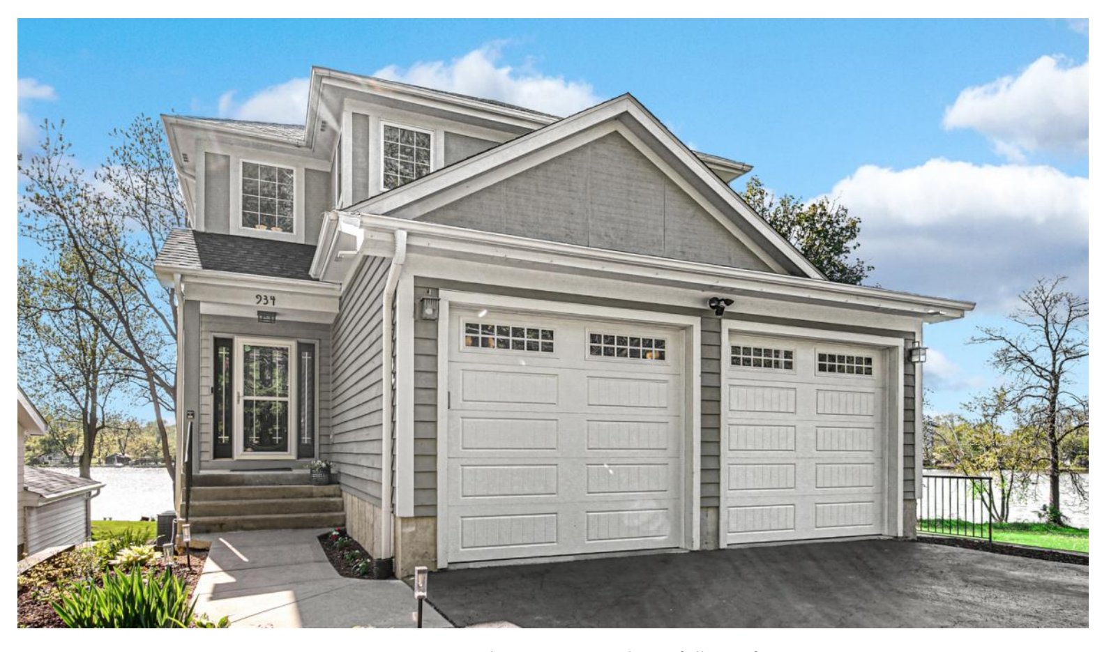
MLS# 12318233 Baths: 3 full Saft: 3143 Bedrooms: 4

934 Robertson Road South Elgin, IL 60177